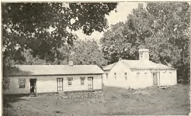
Clermont Academy, and Bock Row, in which roomed students from a distance.