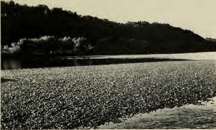
FIG. 2. Photograph of the type-locality, Little Tennessee River at Coytee Spring, River Mile 7, Loudon County, Tennessee, as seen during minimum flow looking downstream from the gravel island which is slightly upstream from the spring outflow.

caudal peduncle and lower caudal fin base. Similar tubercles that are not borne by scales occur on the cheeks and breast, and over the interoperculum, rami of the lower jaw, and lachrymal (anterior infraorbital). Cteni on scales along the anal fin base are elongate in tuberculate males.