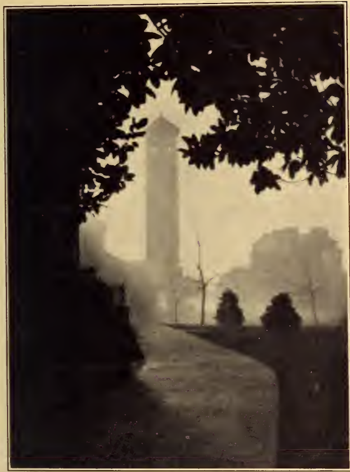
A GLIMPSE OF MEMORIAL CHURCH

This is the center of the religious life of Hampton Institute. Workers and students may join Memorial Church by Association on statement of their membership in other churches.