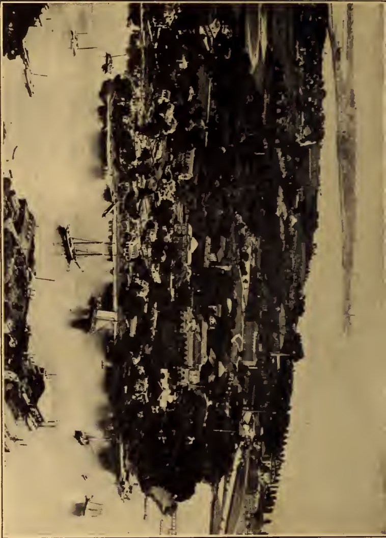
This view of Hampton Institute from the air shows also, in the background, the buildings of the National Soldiers' Home, and in the distance Fort Monroe and Old Point Comfort. In the immediate foreground are wharves of the town of Hampton.