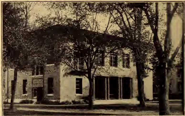
CLARKE HALL, THE Y. M. C. A. CENTER

This auditorium is in constant use for evening prayers, school assemblies, and community gatherings. Here the Negro spirituals are sung every Sunday evening by the entire school and here are also given Anniversary and Commencement programs, concerts, lectures, plays, and moving pictures.