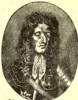
King William III.