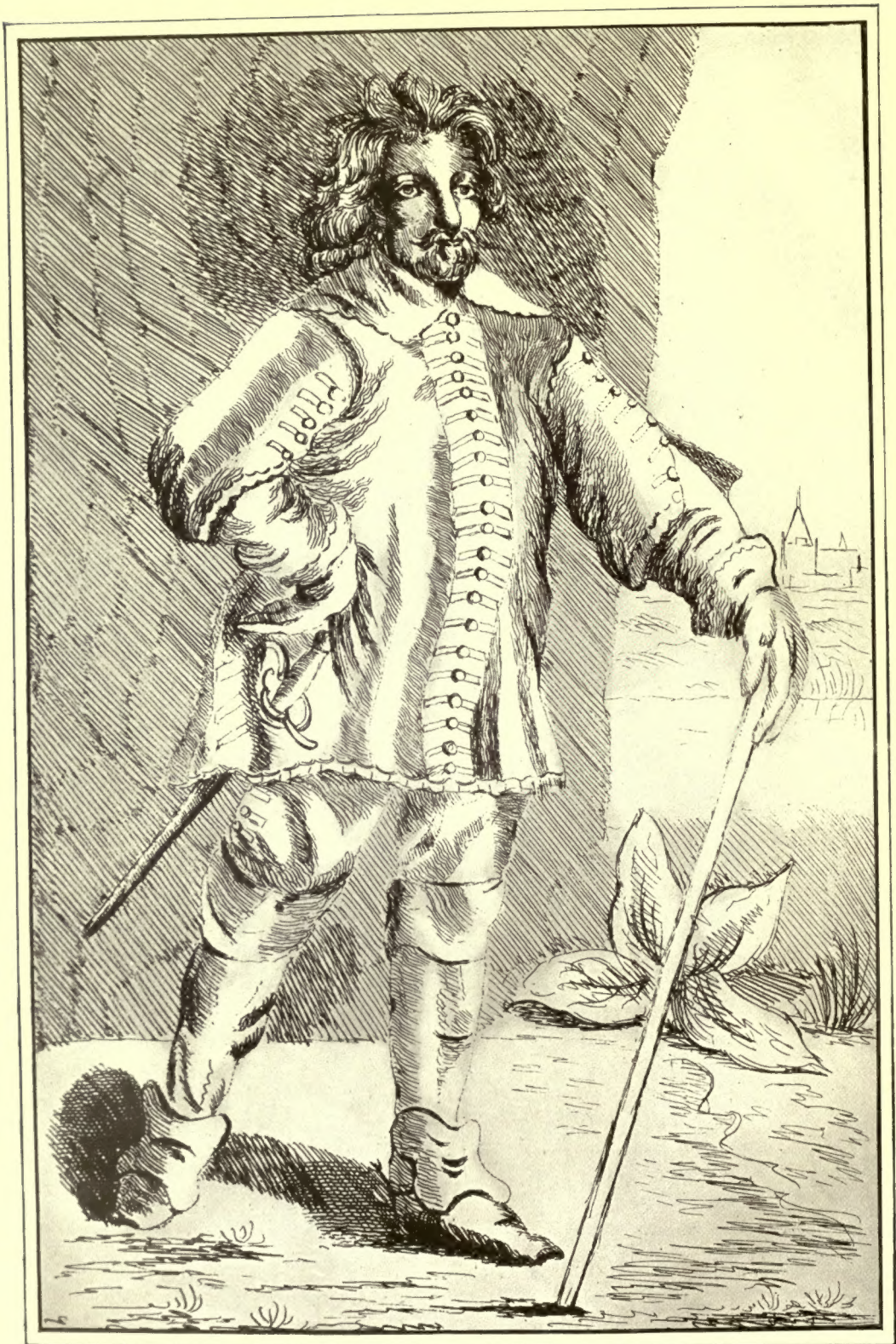
MAJOR-GENERAL SIR THOMAS MORGAN, Commander-in-Chief in Scotland at the Restoration

(From an Engraving at the British Museum)