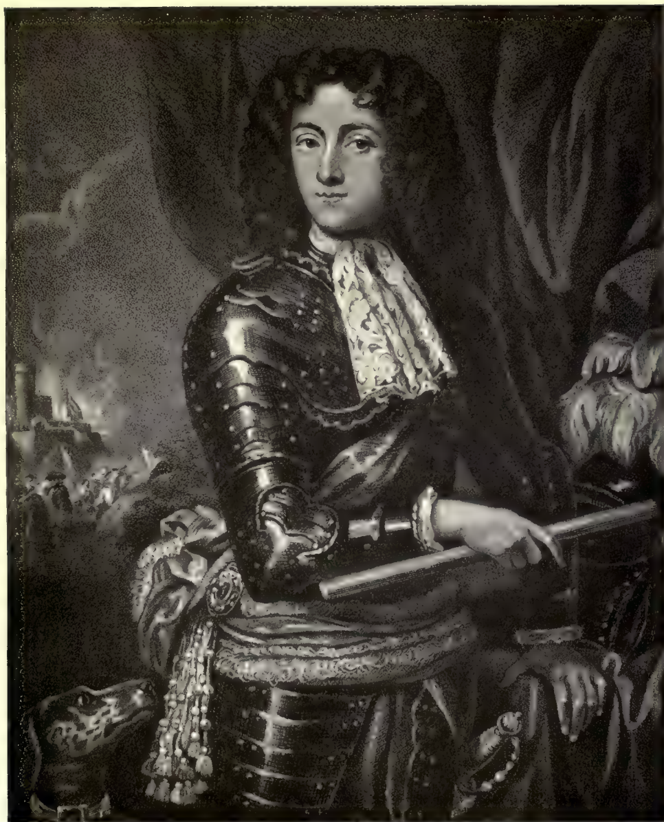
JAMES SCOTT, DUKE OF BUCCLEUCH AND MONMOUTH