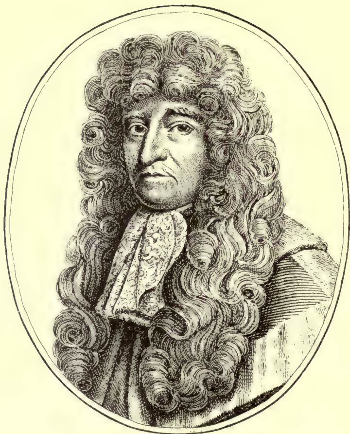
George Livingston Earl of Linlithgow From an Original by R.White.