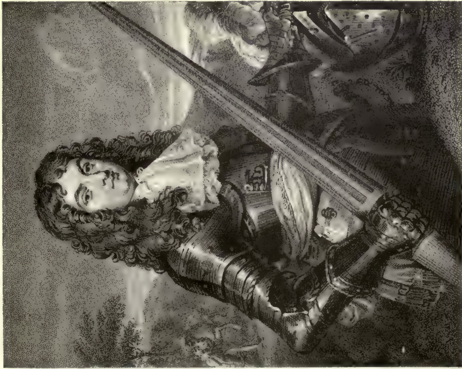
JOHN LESLIE, EARL OF ROTHES, created DUKE OF ROTHES