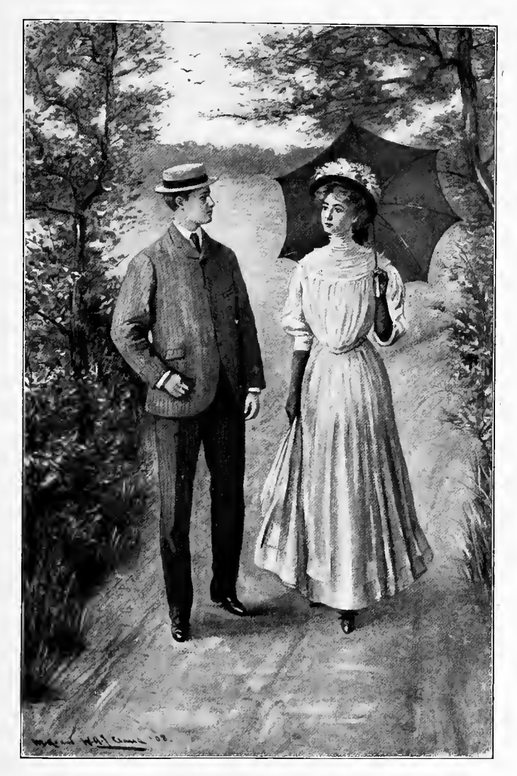
"COME, I'M GOING TO WALK HOME WITH YOU."