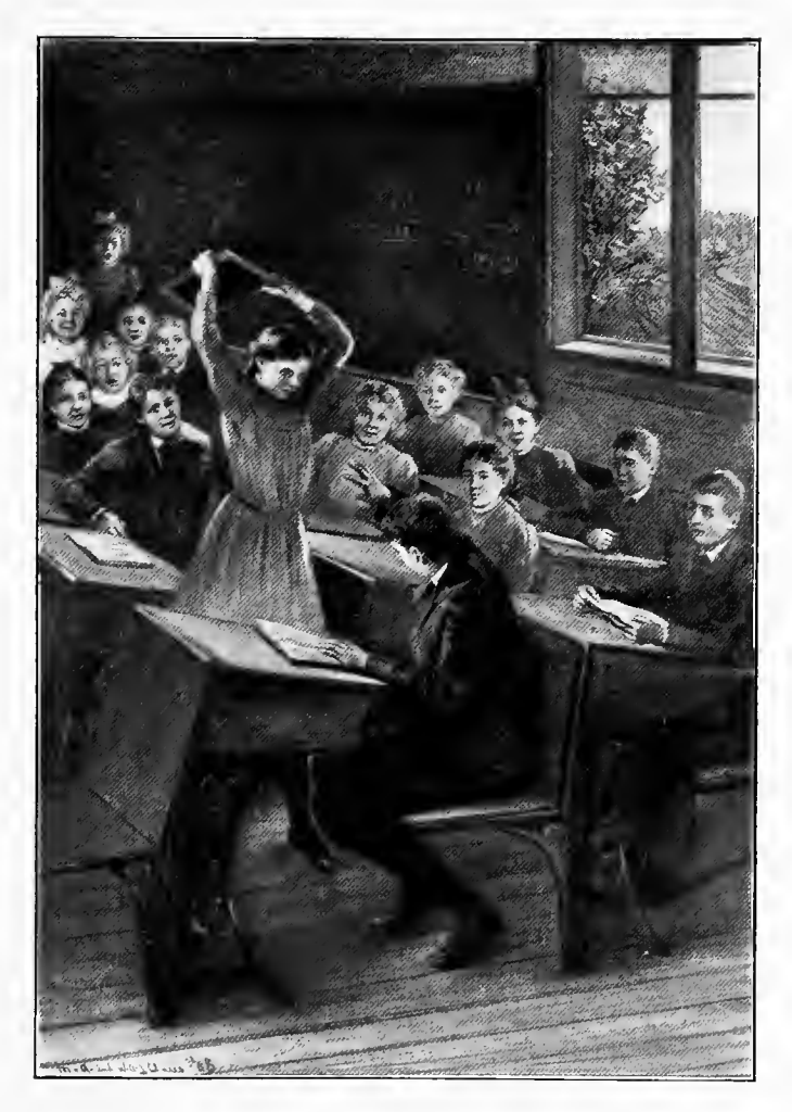
"THWACK! ANNE HAD BROUGHT HER SLATE DOWN ON GIL-BERT'S HEAD."