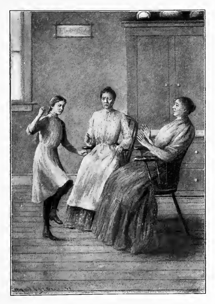
"'I HATE YOU,' SHE CRIED IN A CHOKED VOICE, STAMPING HER FOOT ON THE FLOOR."