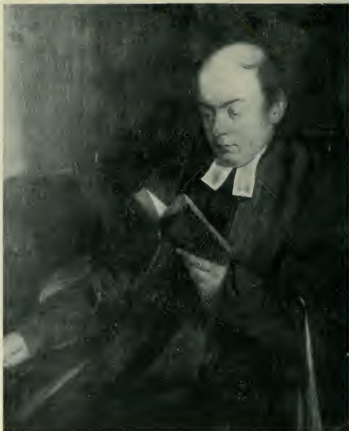
THE REV. SAMUEL BUTLER, D.D., Headmaster 1798—1836.